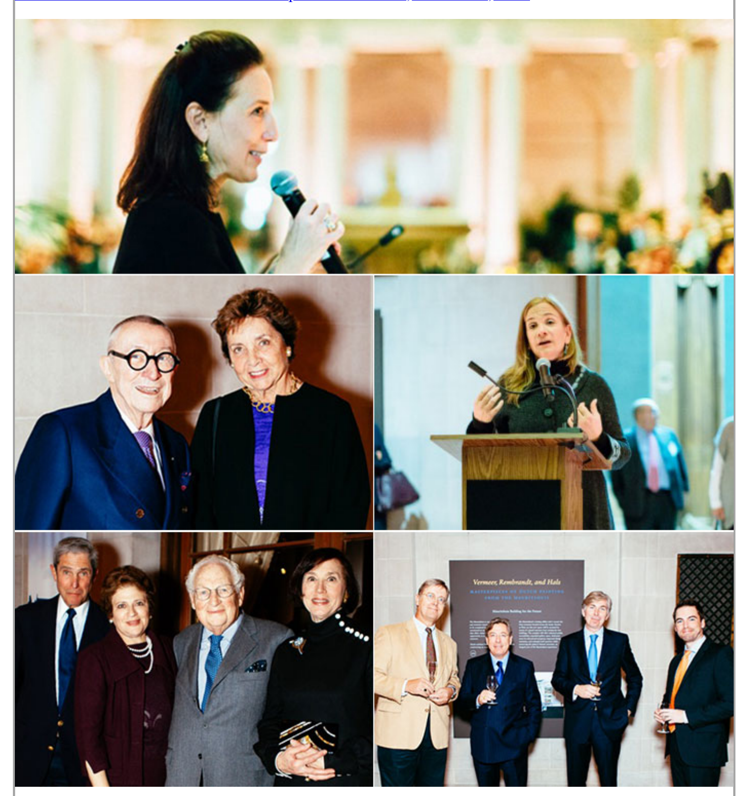
American Friends of the Mauritshuis reception at The Frick, October 28, 2013